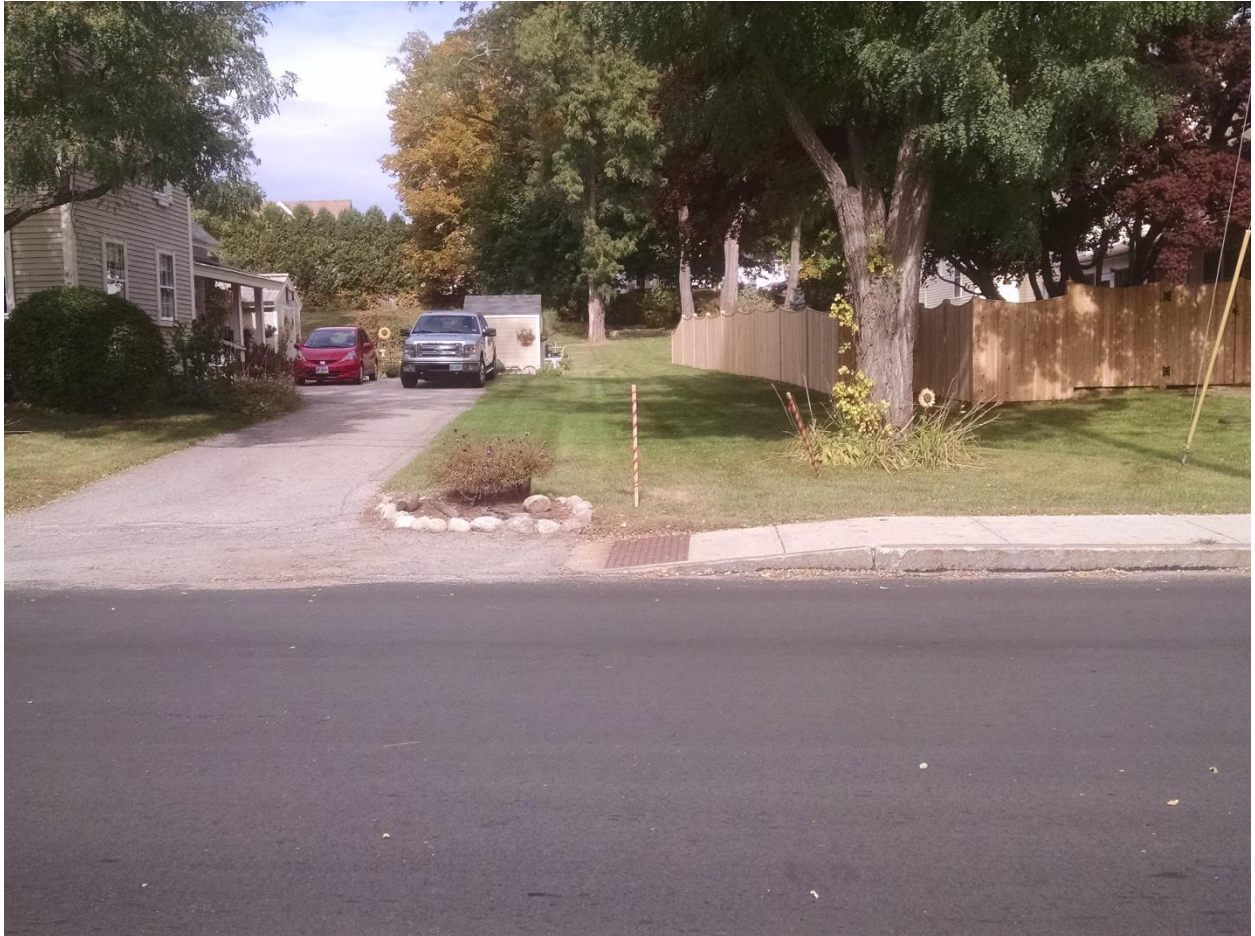
Option B – Eversource 3 phase pole placement